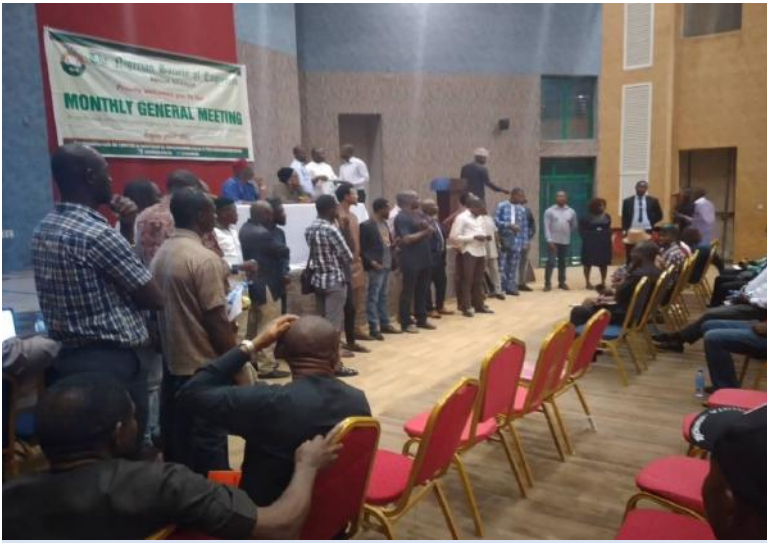
Welcoming of New Members at the February OGM