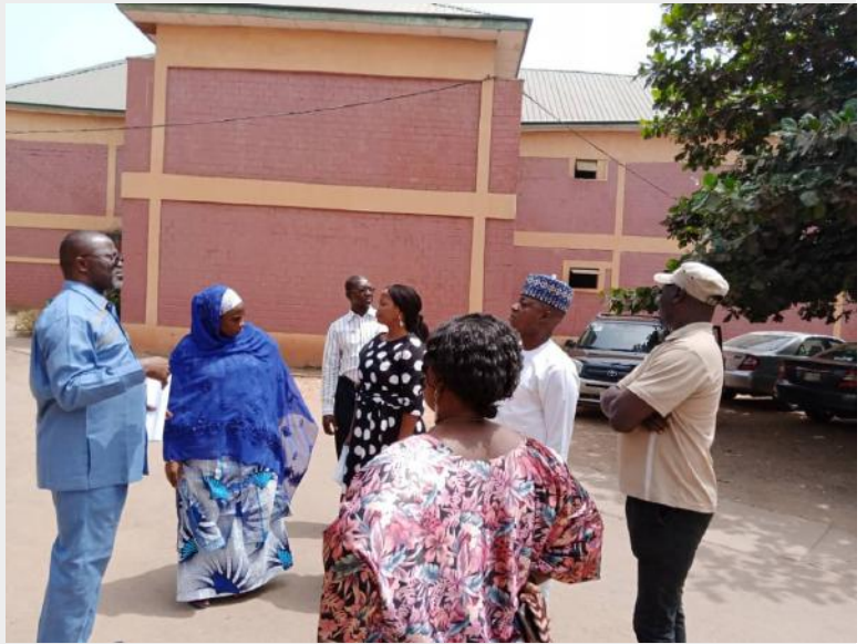
NSE Abuja Branch Chairman, Executive Members and Staff of JSS Area 11 during visit.