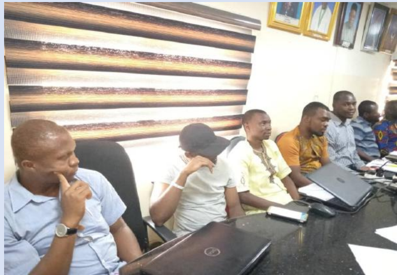
Cross section of members during the free training