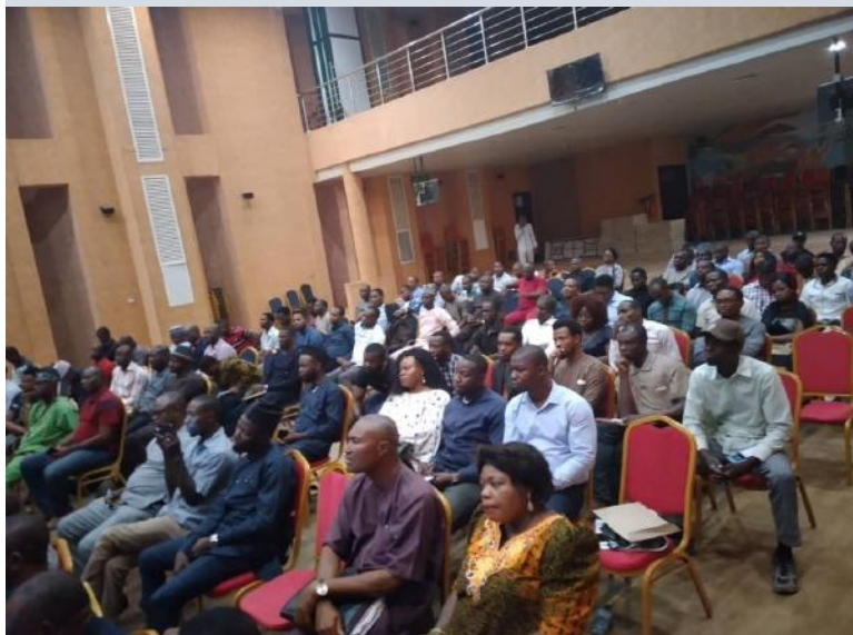
Cross section of members at the OGM

As a tradition of the Branch, senior colleagues present were recognized, after which the minutes of the previous meeting was read, corrected, and adopted.