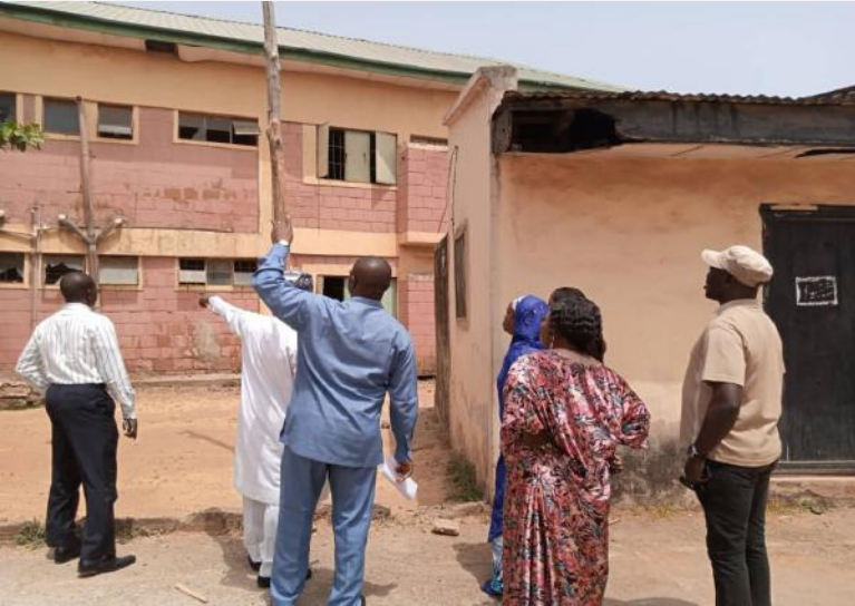
NSE Chairman with his Executive Members during the assessment at JSS Area 11