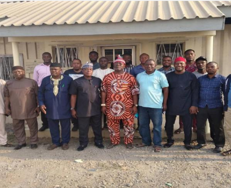
Group Photo of the NSE Prospective Corporate Membership Workshop