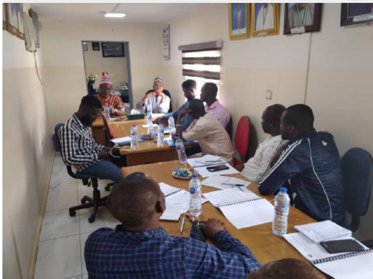
Cross section of members at the Training.