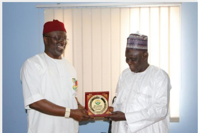
NSE Abuja Branch Chairman presenting a souvenir to the President