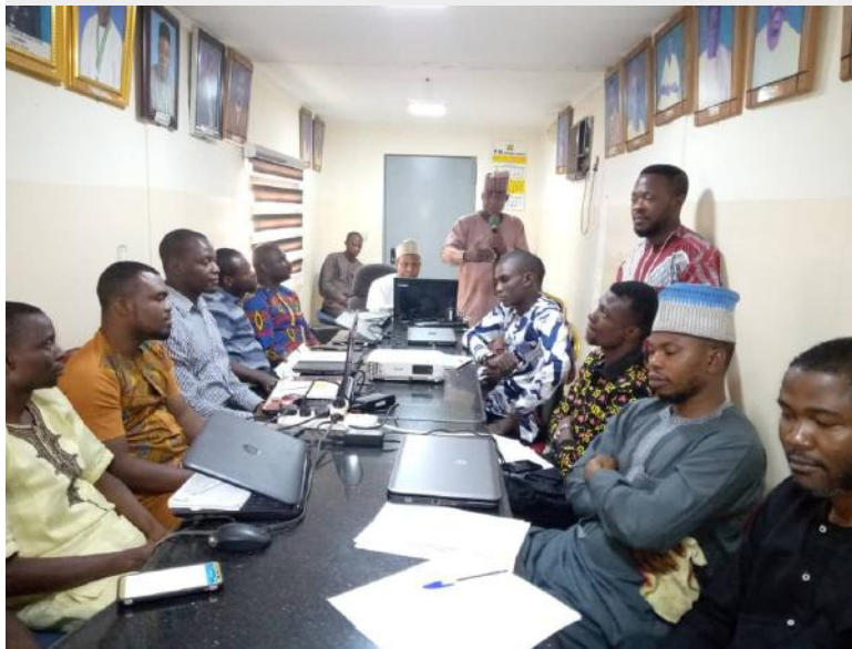
Cross section of Members during Training

The Nigerian Society of Engineers Abuja Branch organized a free professional developmental training on the use of Microsoft Excel, Essay writing and AutoCAD for Members and prospective NSE Corporate Members. The training was held on 15 th February 2020 at the Branch Secretariat behind Dantata & Sawoe main yard Garki 2 Abuja.