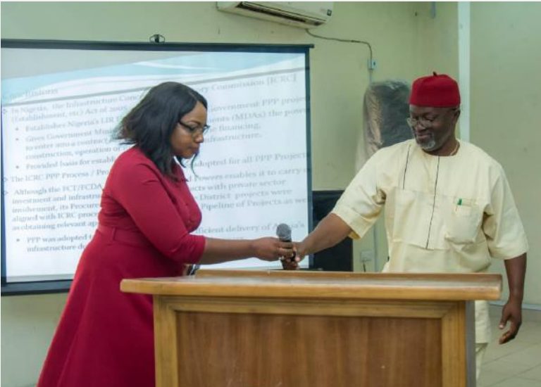
UNIABUJA Faculty of Engineering Public Lecture