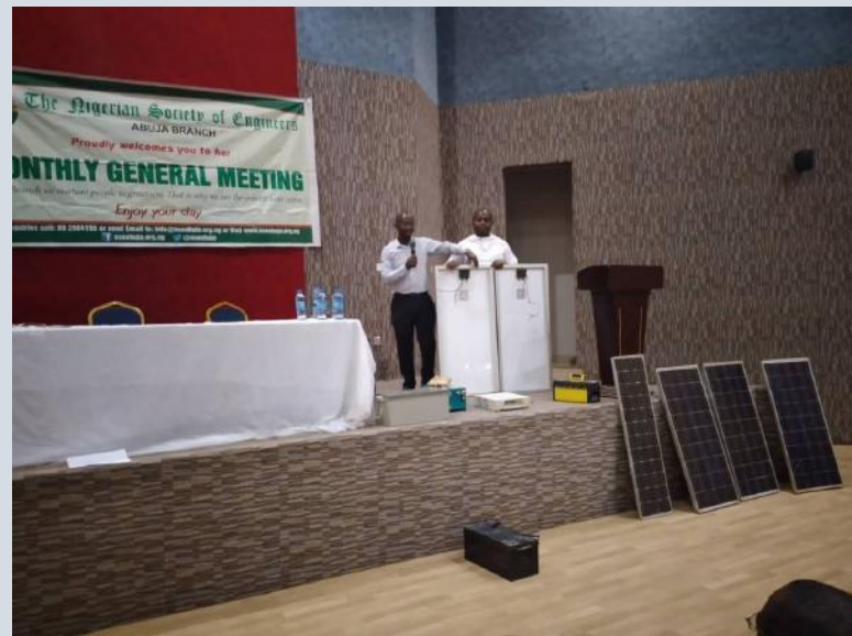
Practical session on Solar installation by Second Presenter

The topic attracted series of vital questions which were answered by the Presenter and contributions made by members.