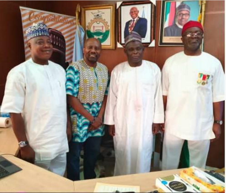
Vice Chairman NSE Abuja Branch, London Branch Chairman, NSE President and Abuja Branch Chairman