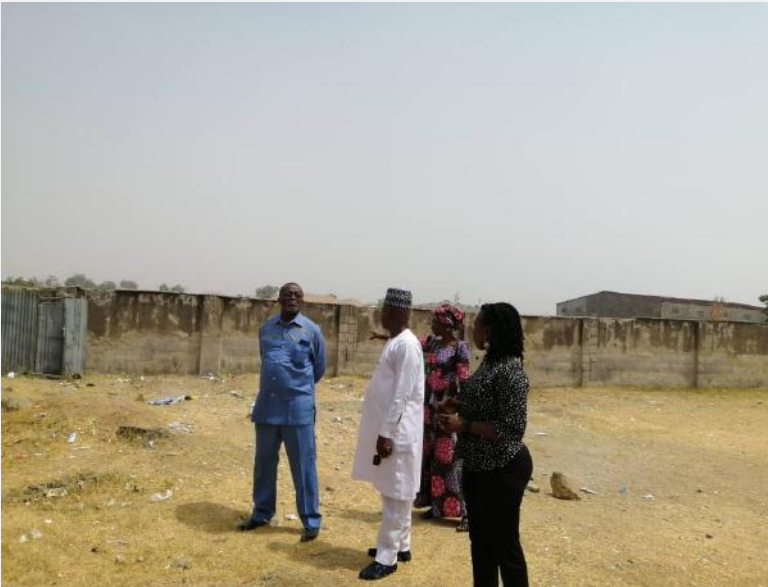
Chairman with his Executive Members during the assessment at LEA Primary School, Sabon Lugbe.