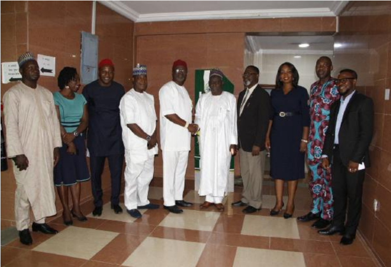
Group photo of NSE President, the Executive Secretary and NSE Abuja Branch Executive Members