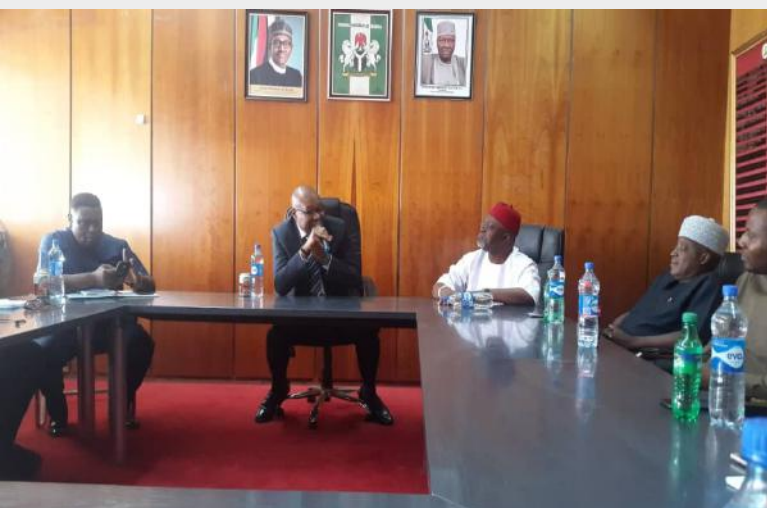
Permanent Secretary with NSE Abuja Branch Delegates