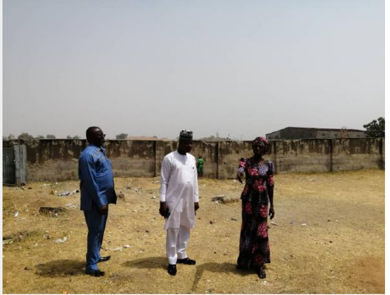
NSE Abuja Branch Chairman, Vice Chairman and Headmistress of LEA Primary School, Sabon Lugbe during Visit.