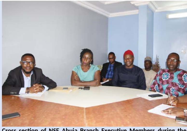
Cross section of NSE Abuja Branch Executive Members during the courtesy visit to NSE President.